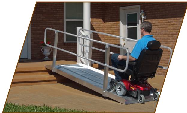
Shown with Handrail