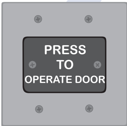
#1078-P (Anodized Black Aluminum Face Plate with Engraved Legend)

provide reliable activation of any automatic door.