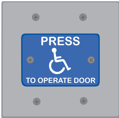
#1078-H (Anodized Blue Aluminum Face Plate with Engraved Legend)